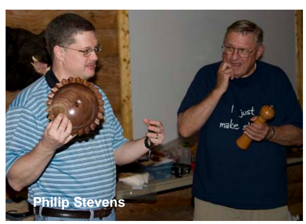
Turned and CNC (two bowls and a pepper mill)