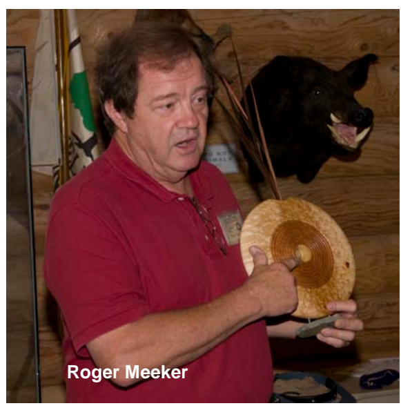
Birdseye Maple Vase