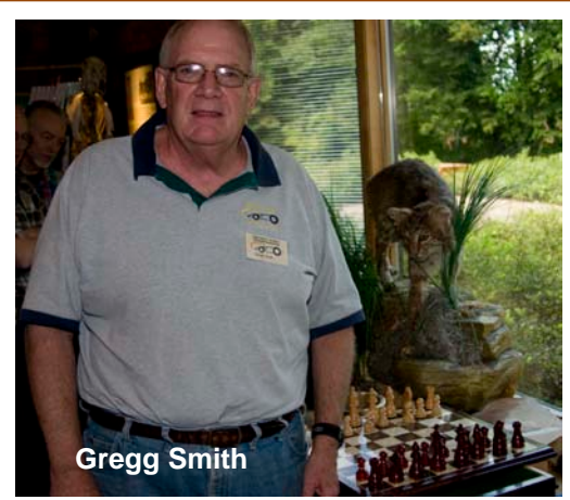
Remarkable Chess Set