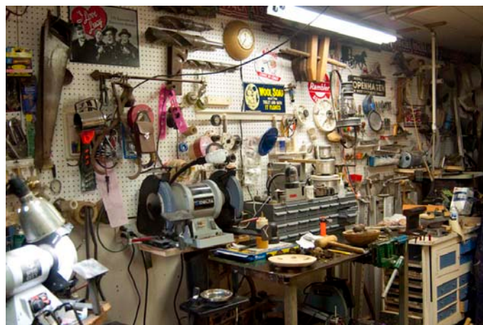
The final area has an array of tools nicely organized on the wall. What they are there for, I sure don't know!