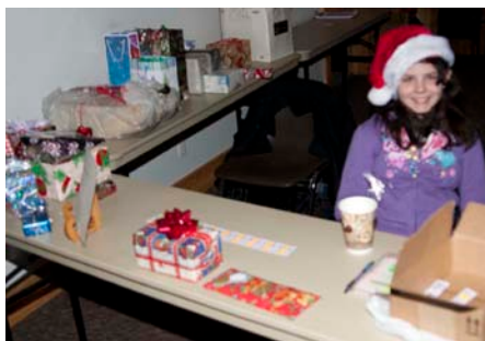
Gift Exchange Elf