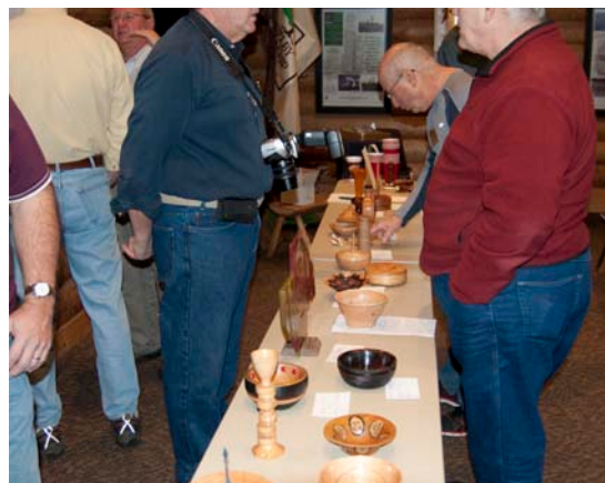
Walk around and viewing