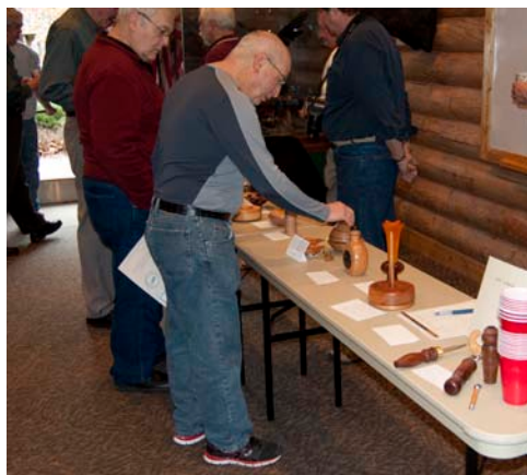
Walk around and viewing