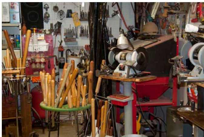
An area primarily for woodworking clamps

In this area Ray has many of his wood turning tools and 2 grinders that provide easy access.