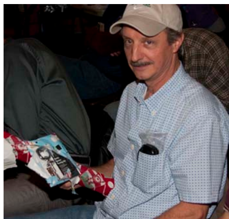
Wood and a Bottle Stopper