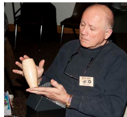
Hand Turned Vase