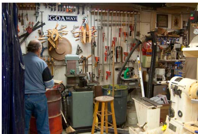
After looking around and photographing Ray's shop your head begins to spin.