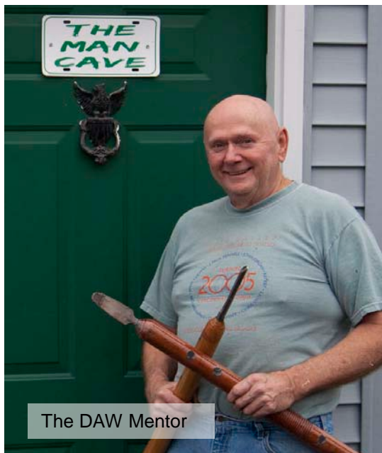
The DAW Mentor