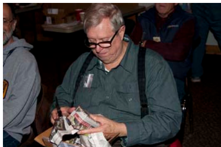
3rd Box Opened