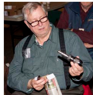
Finally, a Keyless Chuck