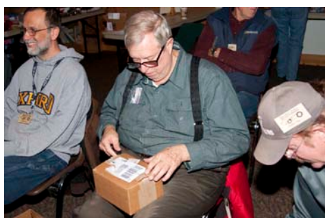
2nd Box Opened