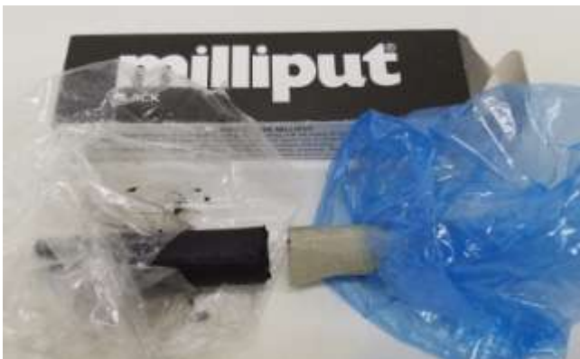
Example of Milliput before mixing (two clay like logs)