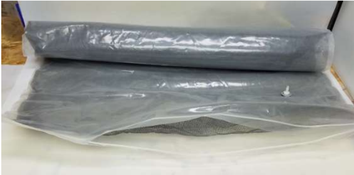
Larger items can be stabilized in a vacuum bag