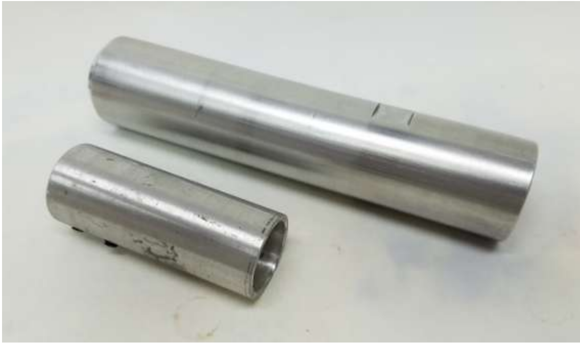
Beall also has an extended shaft available to reach into deeper bowls.