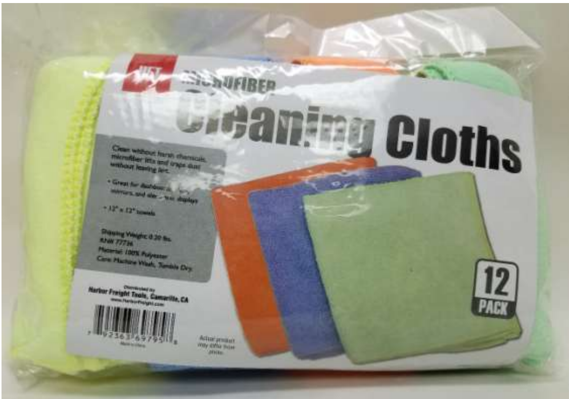
Microfiber Clothes will help clean up the sanding dust, but I like to use compressed air first. The compressed air will get the small sanding particles out of grain and cracks.