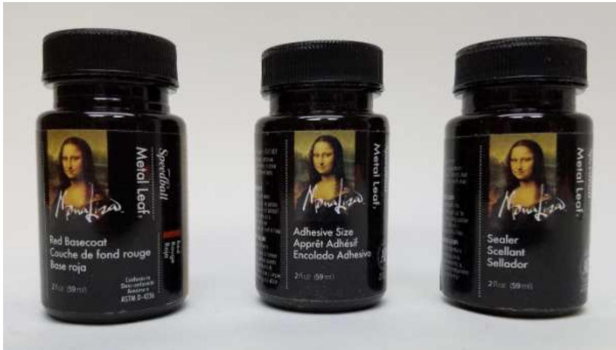
Mona Lisa Products – Basecoat (Red), Adhesive, and Sealer