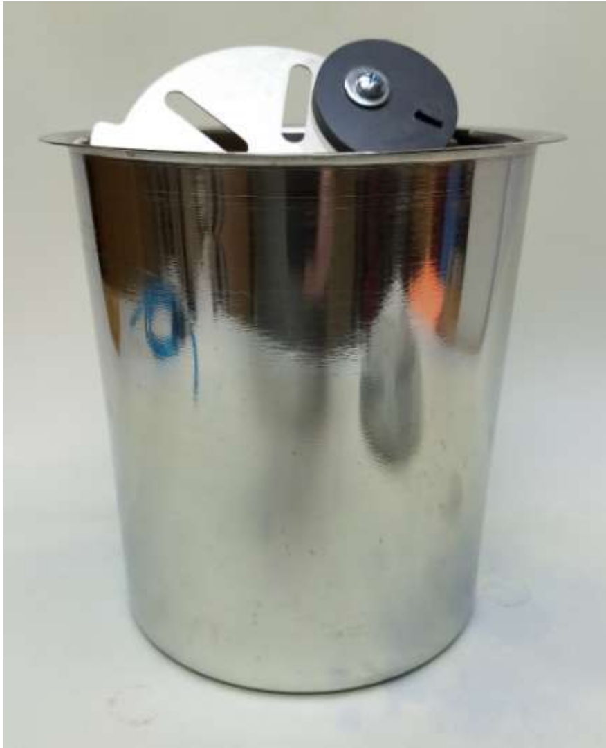
Vacuum Chamber to hold wood and stabilizing solution (hold down required because wood floats)