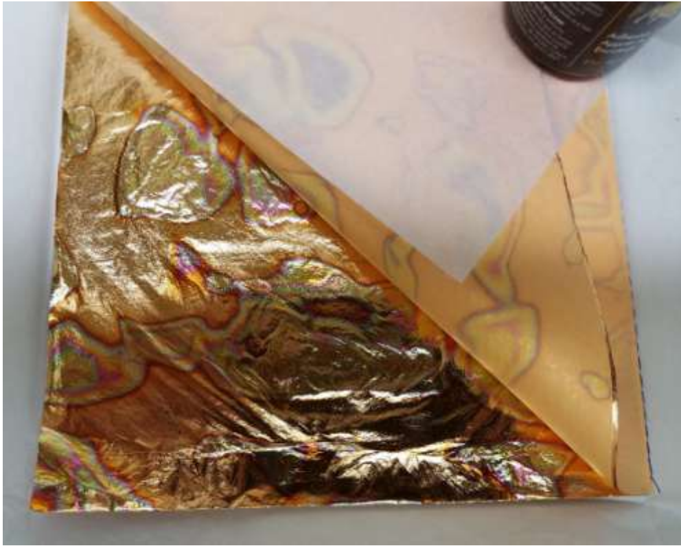
Example of Variegated Leaf (Gold with Red)