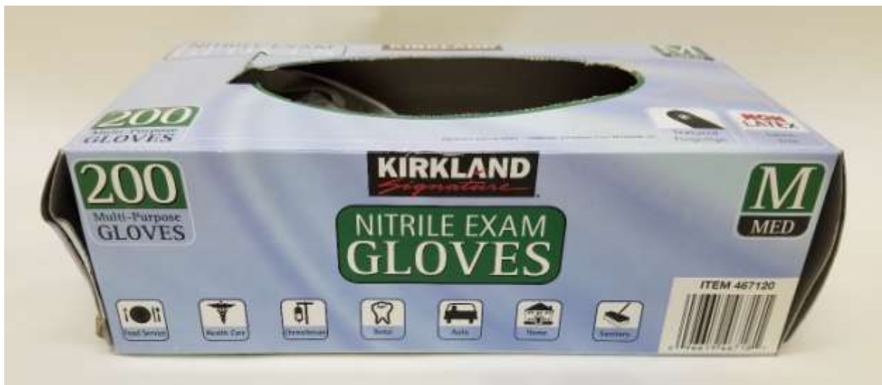
Nitrile gloves to keep Milliput off of your hands