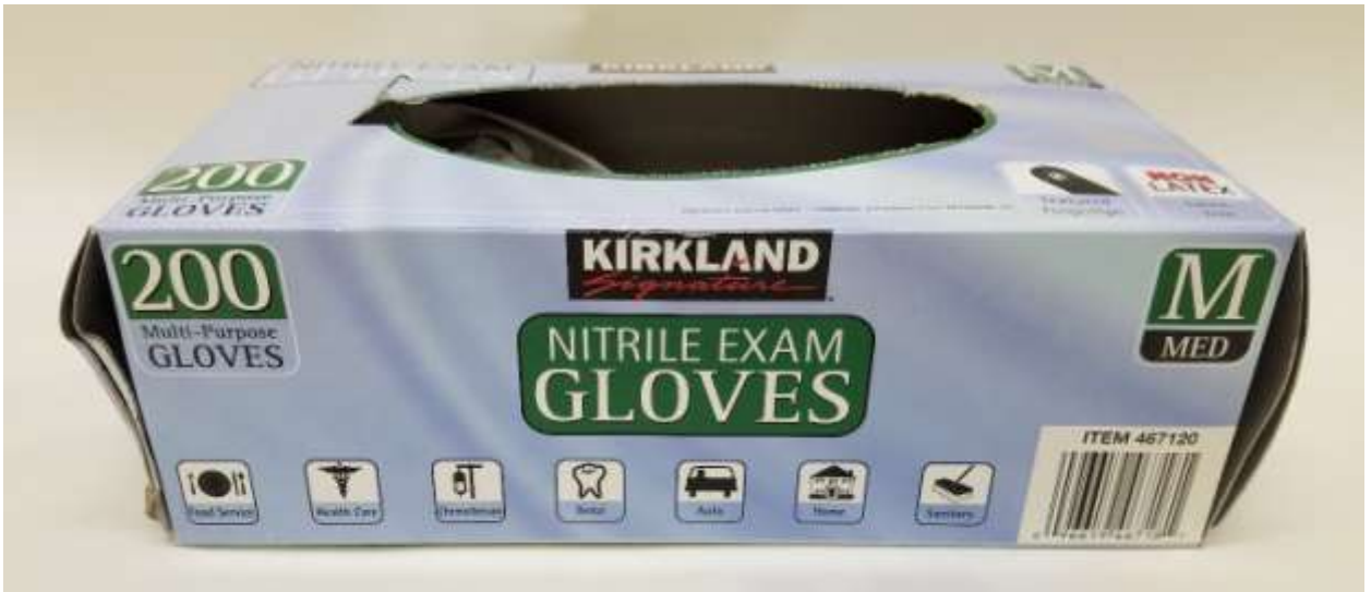
Costco Brand Nitrile Gloves will protect your hands from the finish and give you a better grip