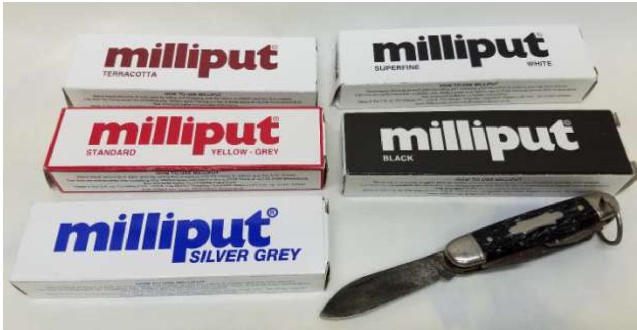
Milliput come in five different colors (knife to cut sticks)