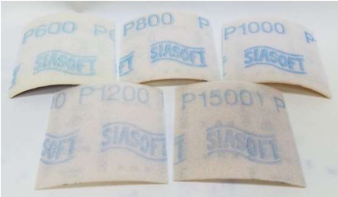
Between coats I sand with siasoft sandpaper (Vinceswoodnwonders.com)