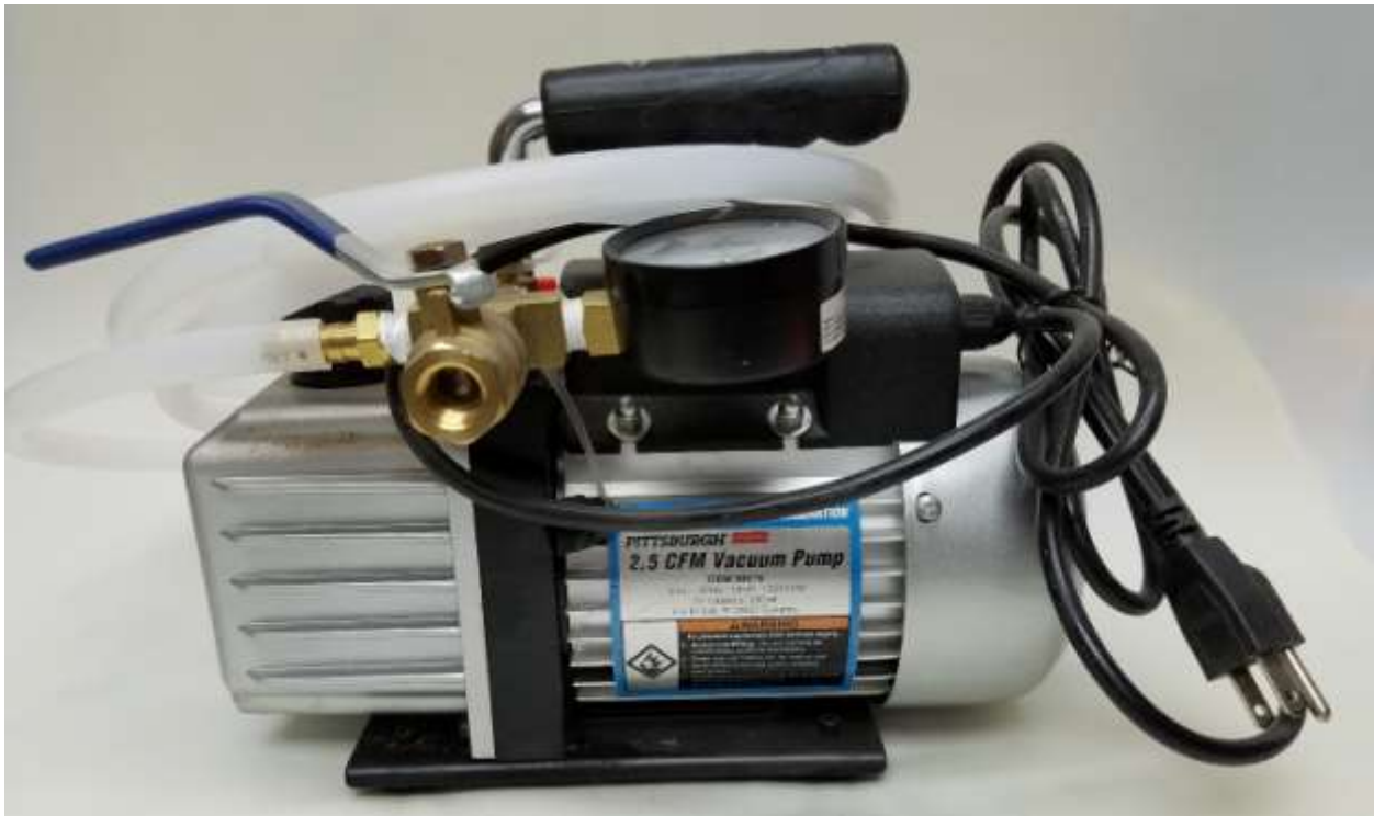
Vacuum Pump to create vacuum in chamber (be careful not to suck up liquid into pump)