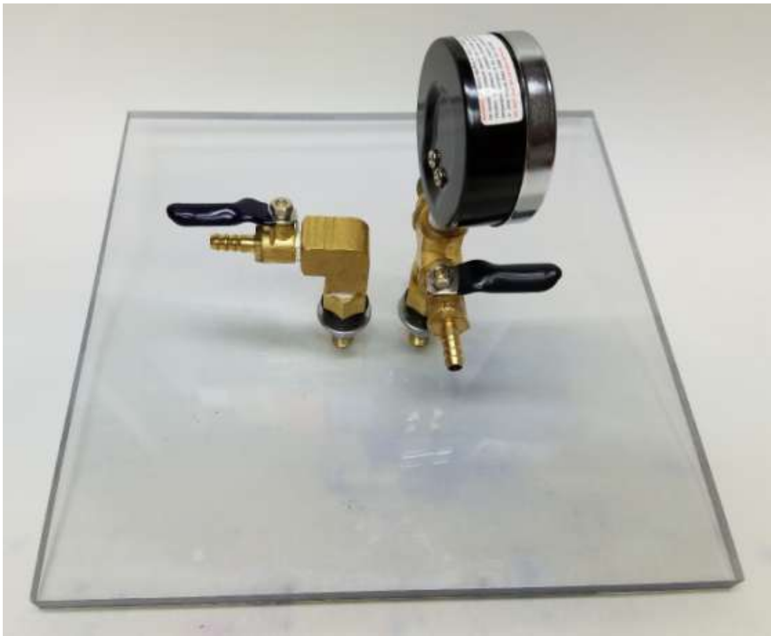
Stabilizing with a bag will pull fluid out of bag. Extra fitting on lid allows pressure pot to be used to collect liquid so it does not go into the vacuum pump.