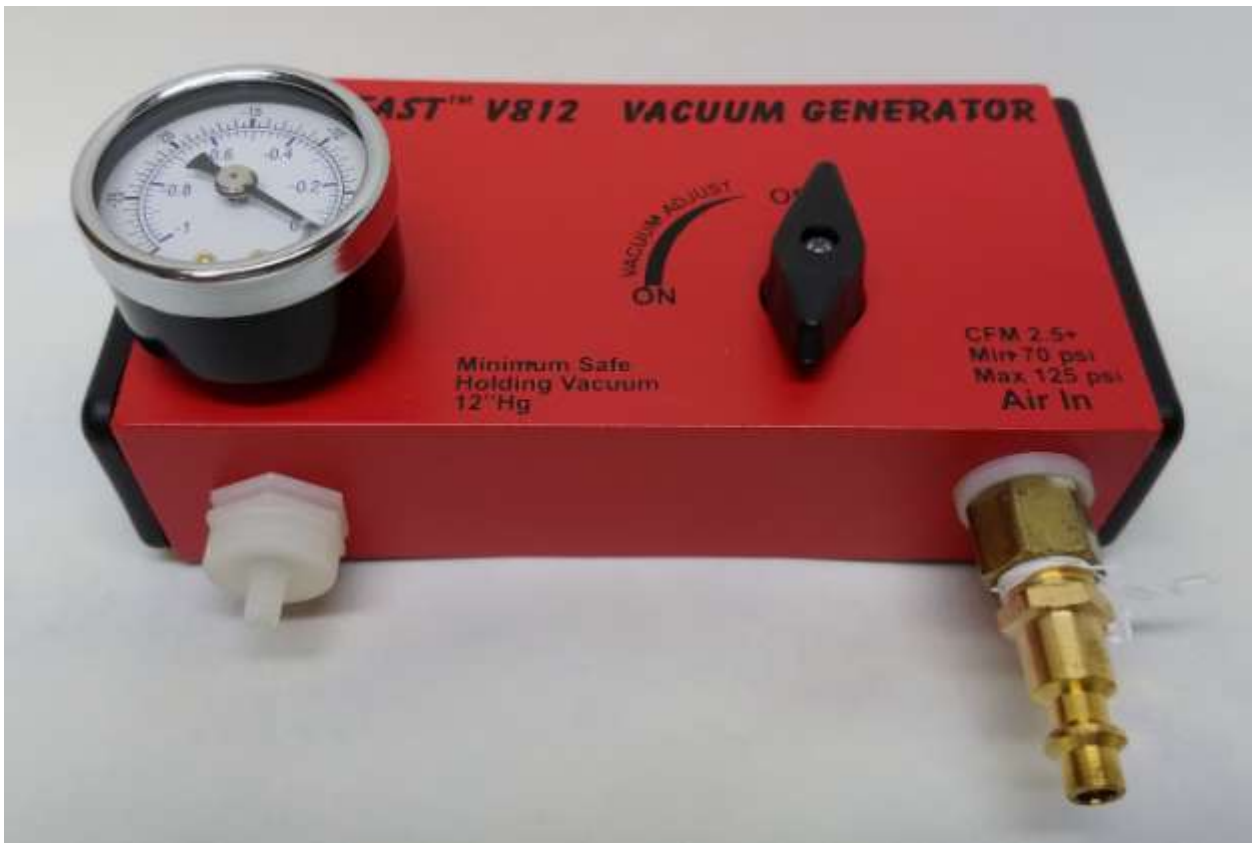
Vacuum Generator (venture) can also be used to generate vacuum