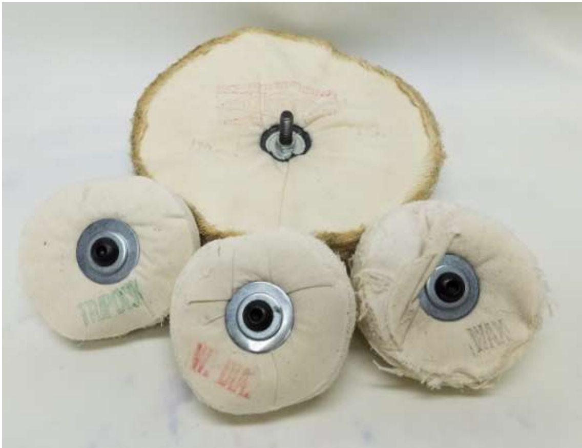
Mini buffs are available for smaller projects. You can see how many times I have used mine (zero).