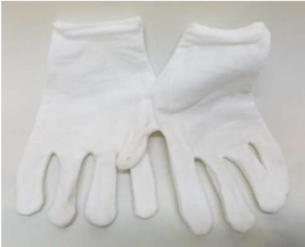
Cotton Gloves make handling leaf easier