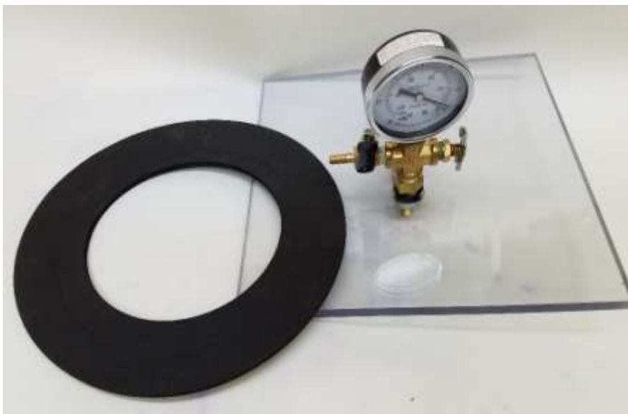
Lid for vacuum chamber with gasket for seal – lid is clear so you can watch the process