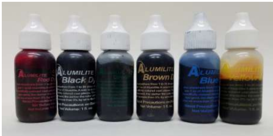
Dye can be used to color the cactus juice before stabilizing