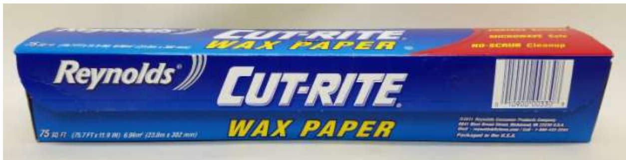
Wax paper to keep work area clean and place to roll out Milliput