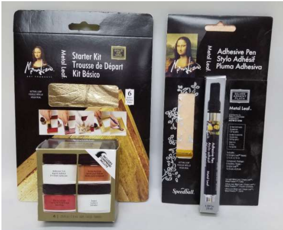
Mona Lisa Leafing Kits