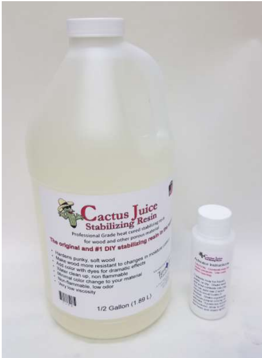
Cactus Juice wood stabilizer