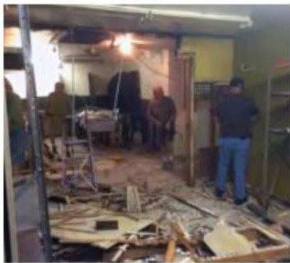
The DAW crew knee-deep in demolition, knocking down walls and moving electrical and plumbing, to make smaller units into a larger, more functional space.