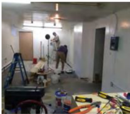
Reconstruction involved updating and adding light fixtures, drywall, and paint, as well as filling, leveling, and sealing the floor.